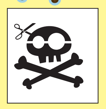
Cut out stencil